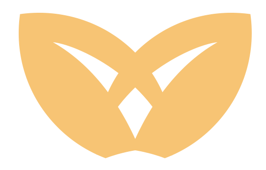
Outcomes vs. Process